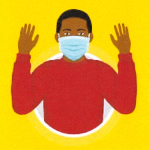
Thoroughly wash your hands before and after touching your mask.