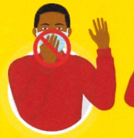
Avoid touching the front of the mask. Only touch the ear loops.