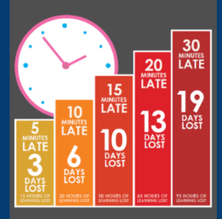
Remember - your education is important - don't miss out!

Well done lateness has improved hugely. Children are no longer missing their phonics lessons KS1 and we can already see the progress